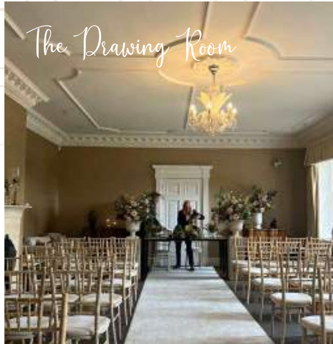
The Drawing Room